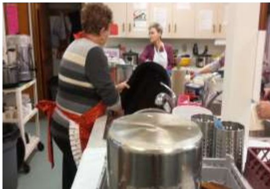
Spring Dinner – May 5, 2019